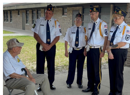
American Legion Post 383